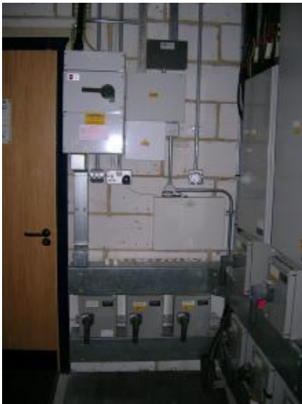
400V switch gear

Our team of highly skilled and dedicated engineers work in strict compliance with statutory regulations and the relevant codes of practice, thus ensuring a high standard of craftsmanship, from the design stages, to the completion of the project.