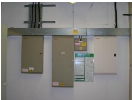
3 phase distribution board