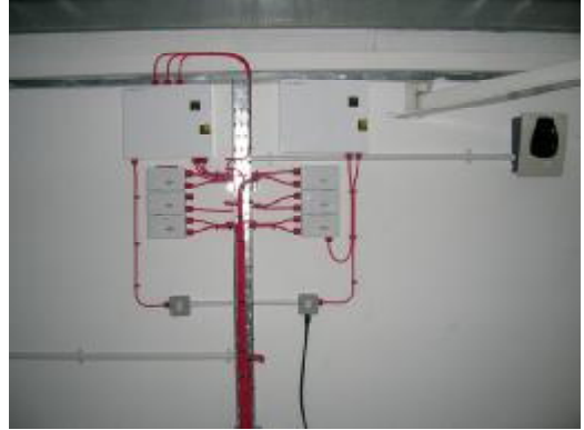
Fire alarm; zone monitors, power supply units And beam detector