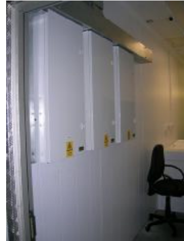
3 phase distribution boards