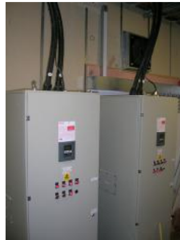
Power factor correction