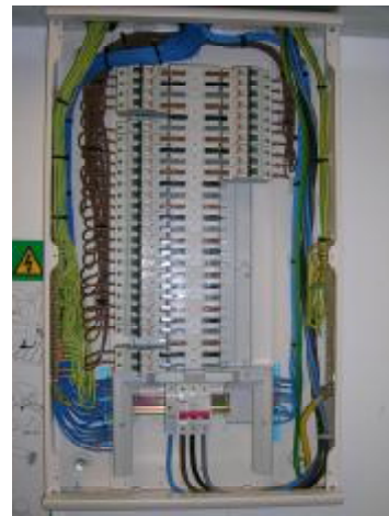
Internal wiring of distribution board