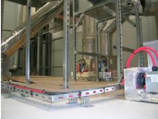
Industrial fire alarm