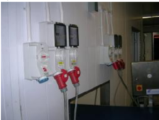
Food factory socket outlets