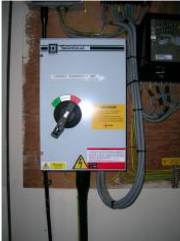
3 phase isolator