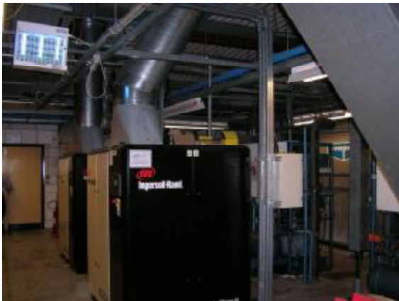
Plant room compressors