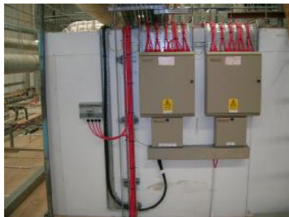
Fire alarm controls

SiS provide a complete fire alarm design, installation, commissioning and maintenance service. SiS have installed many fire alarm systems ranging from small systems in shops, restaurants, and offices to large industrial applications with in excess of 200 devices. SiS are able to supply either analogue addressable or conventional systems to meet individual requirements