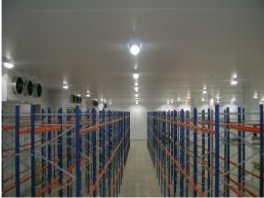
Low bay lighting / emergency lighting Within cold storage warehouse