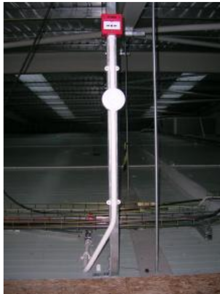
Fire alarm zone isolator & call point