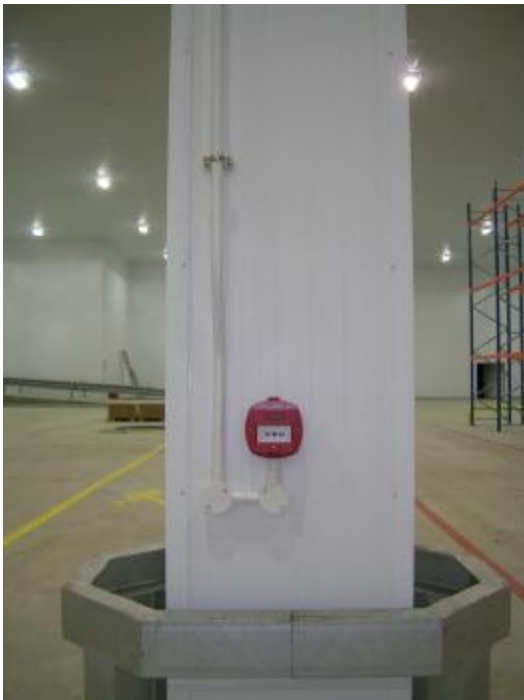
Food safe fire alarm system.