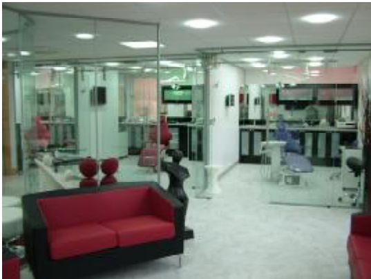
Display / mood lighting

From smaller installation works to complete projects including initial design to installation , commissioning and on-going support , our team of experienced engineers can provide a host of innovative solutions, some of which include:-